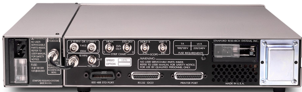
SR625 rear panel