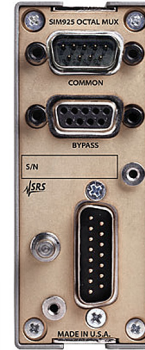
SIM925 rear panel