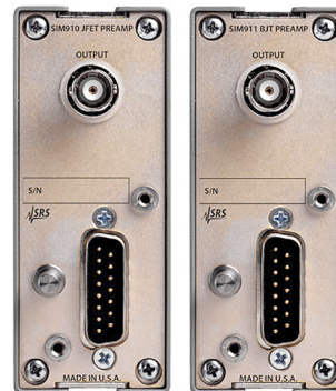
SIM910 & SIM911 rear panels