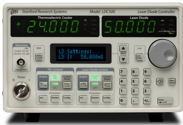
LDC500 front panel

The LDC500 series offers an auto-tuning feature which automatically optimizes the PID loop parameters of the controller. Of course, full manual control is provided too. Dynamic transfer between CT and CC modes for the TEC is also easy — just press the Temp/Current button.