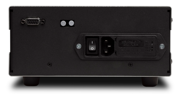
CS580 rear panel