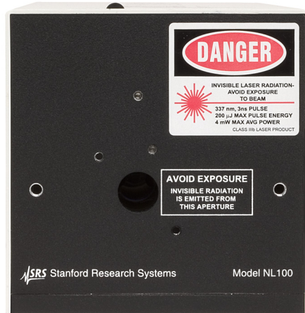
NL100 front panel