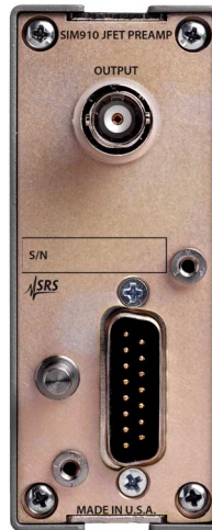
SIM910 rear panel