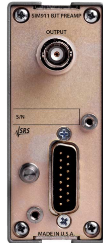
SIM911 rear panel