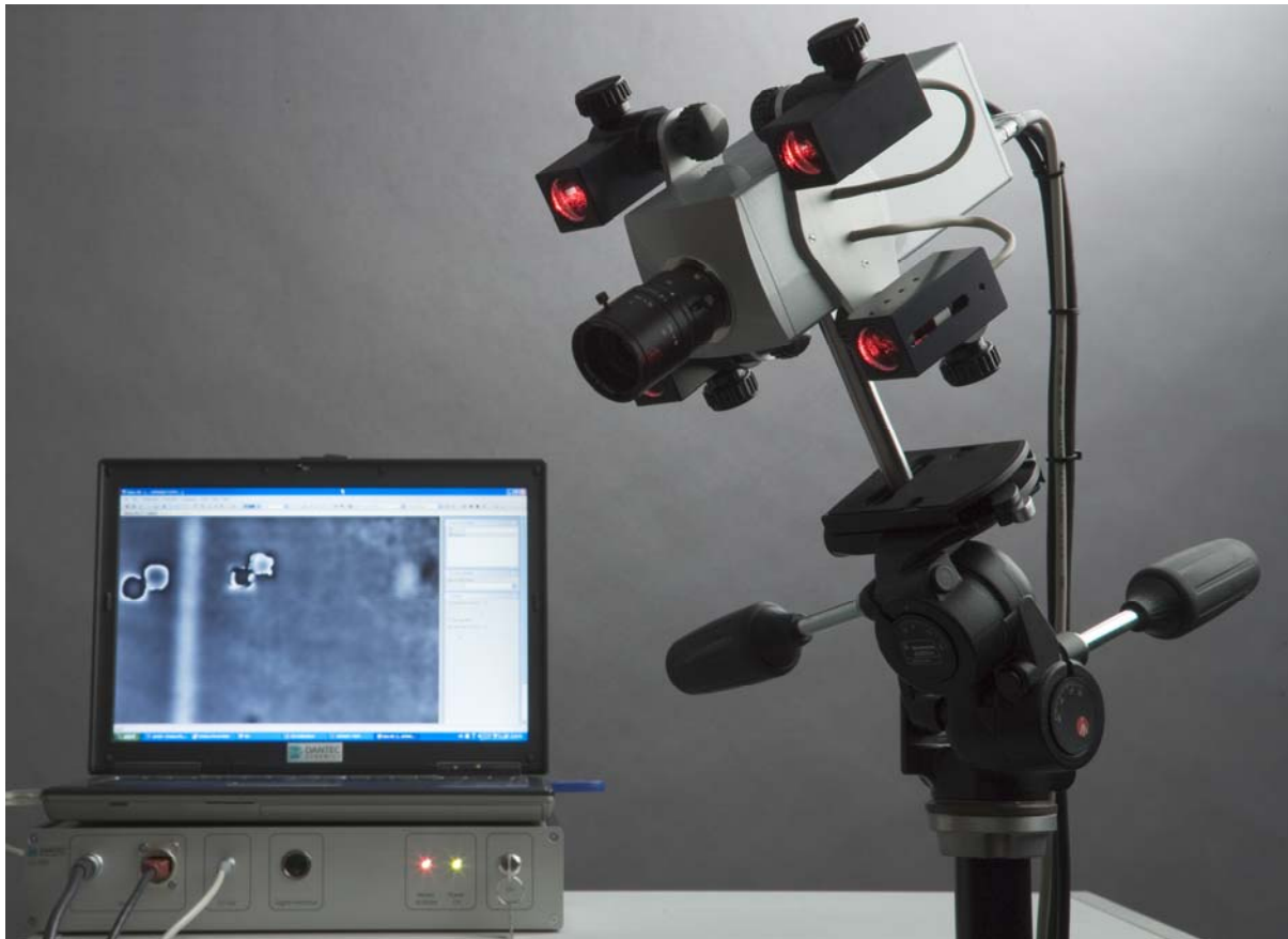
Portable Q-800 System with 4 laser diodes - Non Destructive Testing, Non-Contact, Full-Field