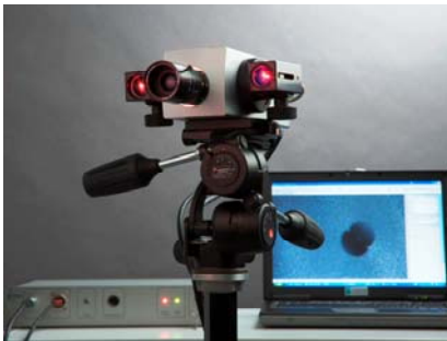
Portable Q-800 System with 2 laser diodes

For additional information please contact your Dantec Dynamics representative.