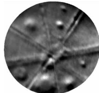
Live results from an inspection showing impact damage and structural information