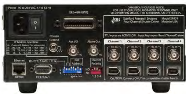
SR474 Rear Panel