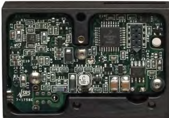
SR475 Shutter Head with cover removed, revealing control system electronics

The 3 mm clear aperture is designed for easy alignment and is large enough to be used with common light sources. Typical rise and fall times are under 500 \mu s, and repetition rates from DC to 125 Hz can be used. Unlike other shutters, the SRS shutter is not duty cycle limited — you can run any duty cycle you choose.