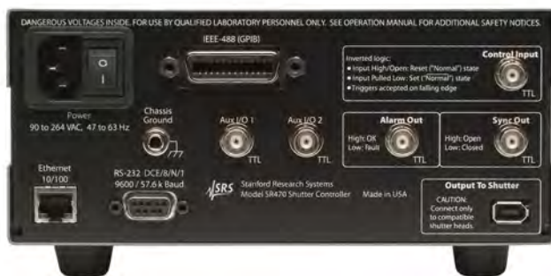
SR470 Rear Panel

The SR470 and SR474 Laser Shutter systems from SRS offer performance and reliability not found in other systems. For more details call us at 408-744-9040.