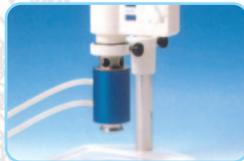
Thermal jacket When using the DIN standard or 'wide gap' coaxial cylinder configurations, the thermal jacket regulates the sample temperature