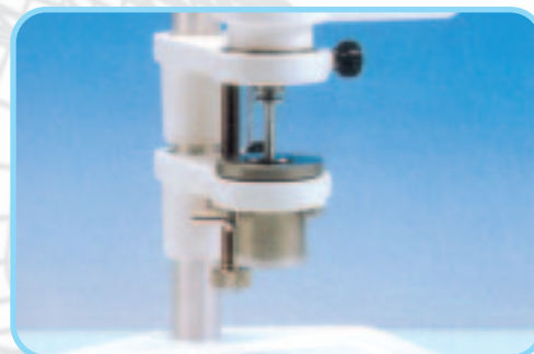
Cone and plate High viscosity fluids and pastes can be analysed with the cone and plate accessories. The Bohlin Visco 88 offers simple, accurate and repeatable gap setting whilst the integral water jacket controls sample temperature.